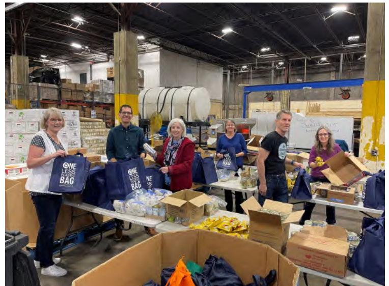
Church Staff packs food for ALIVE!