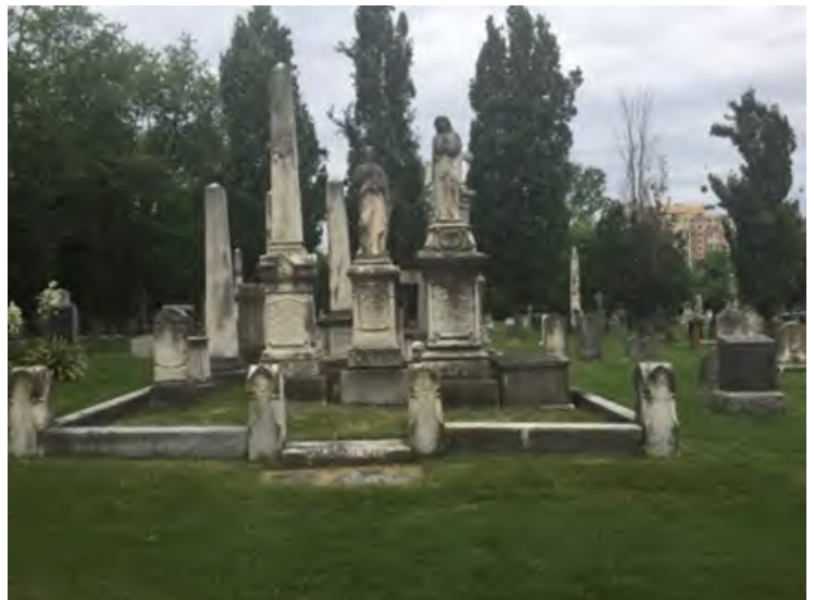
Iconic view of the Cazenove family gravesite in the Presbyterian Cemetery